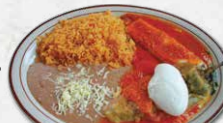
Spinach Burrito Chile Poblano

***These items may be cooked to order.***